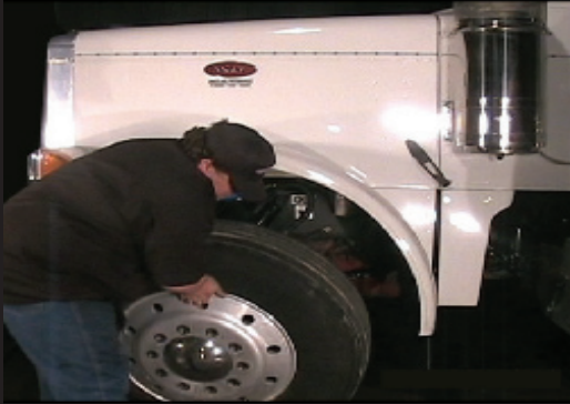
Remove the wheel