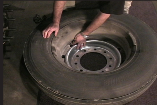
Place the balancer inside the rim, and make sure that it doesn't touch the valve stem and lays flush in the wheel.