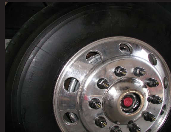
Balancer After installation