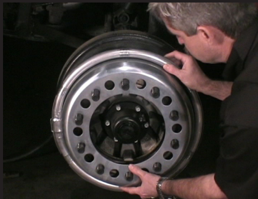
Install the balancer making sure the balancer fits flush over the drum, aligning studs in proper hole.