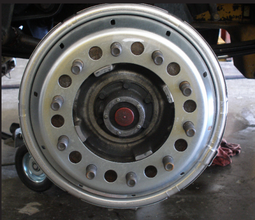
Balancer during installation