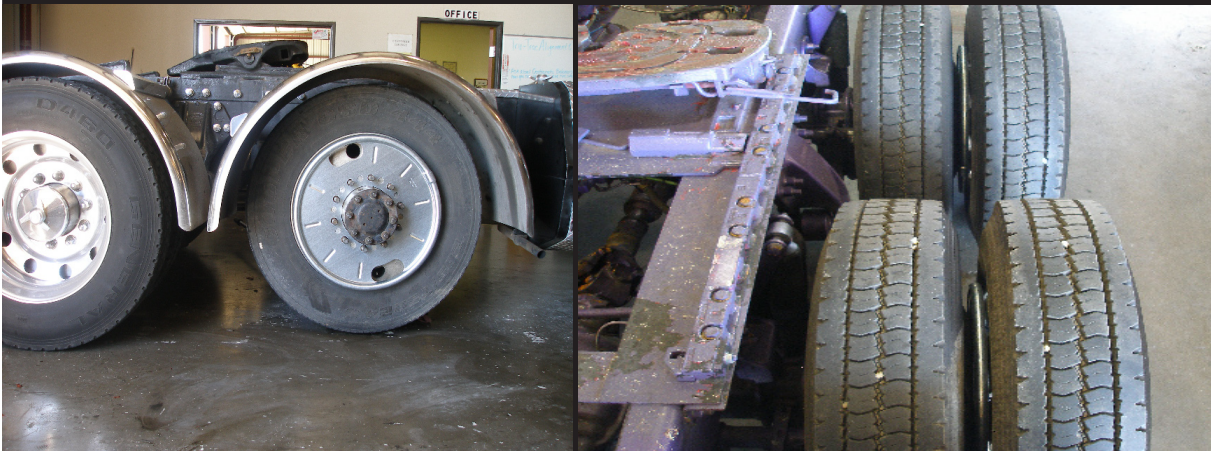
Balancer after installation

Remove the outside wheel and place the balancer between the rear wheels. Align the balancer valve stem access hole with the inside tire valve stem.